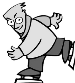
he/ ice skates